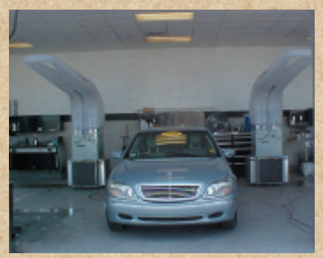
"Cleaner shop environment"